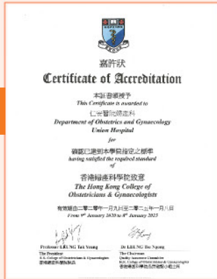
The Hong Kong College of O & G Accreditation

The spacious and harmonious rooms are fully equipped with toilets, television, private refrigerator, telephone and other necessary facilities.